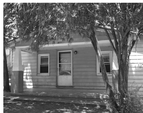
Community house at 911 Nassau St.

TAX-DEDUCTIBLE GIFTS TO THE CATHOLIC WORKER Through the Church of the Incarnation OR through Virginia Organizing.